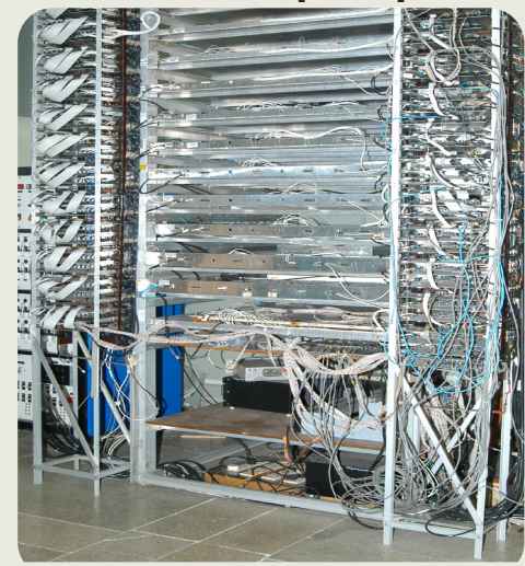
Prototype Stack at TIFR, Mumbai.

More details are available online at: http://www.hecr.tifr.res.in/~ino