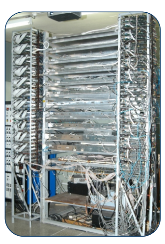
Prototype detector at TIFR.